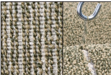
Ordinary loop pile carpet