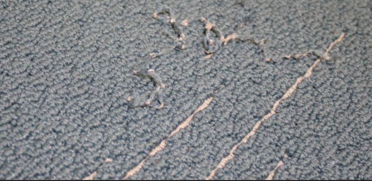
Ordinary loop pile carpet