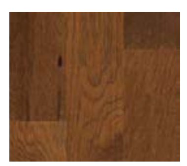
875 Burnished Amber available in 3 1/4" & 5"