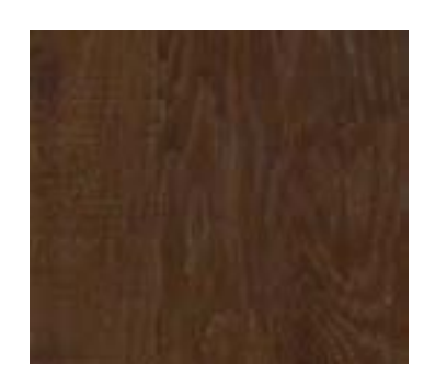
936 Barnwood available in 3 1/4" & 5"