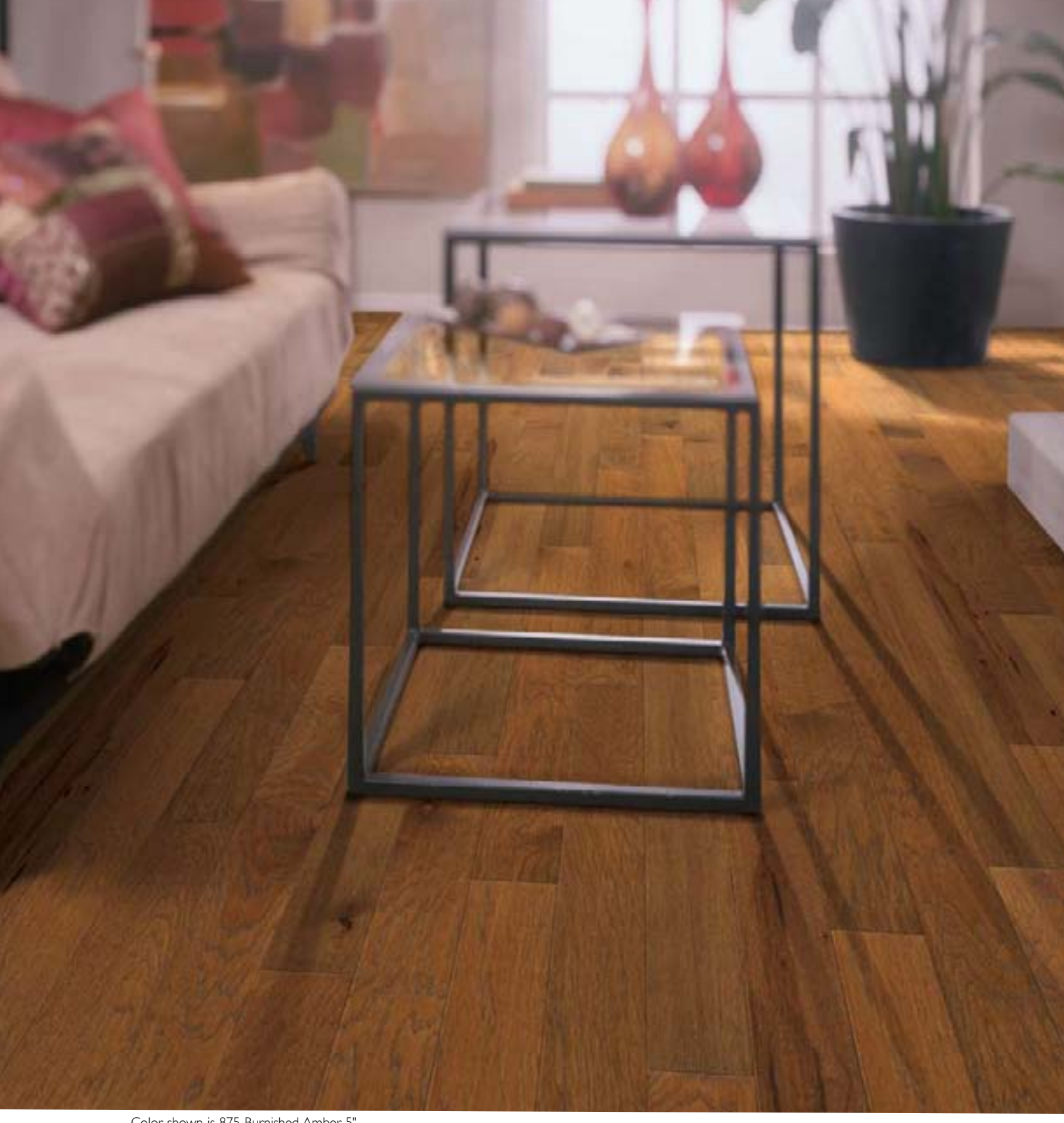
Color shown is 875 Burnished Amber 5"