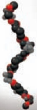
Actual SmartStrand molecule

Each carpet strand has a unique “kinked” structure that bends easily and rebounds quickly to resist the crushing and matting that can happen with other carpets.